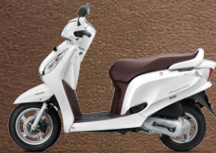
Pearl Amazing White