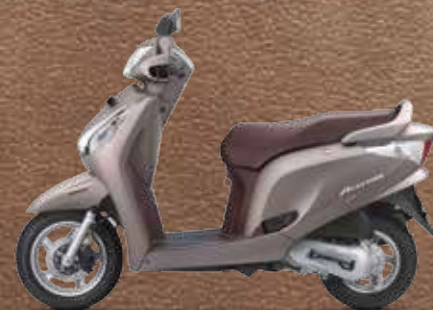
Matt Selene Silver Metallic