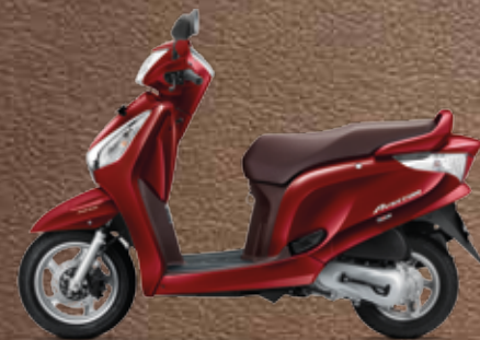
Rebel Red Metallic