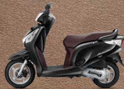
Pearl Igneous Black